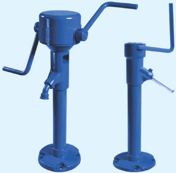
Typical Average Performance Guide